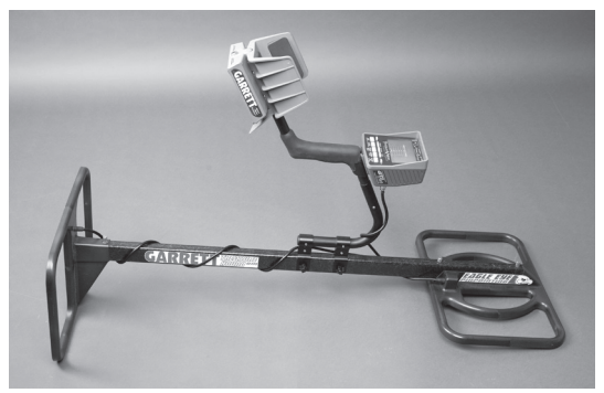
The fully assembled GTI 2500 and Treasure Hound Depth Multiplier.