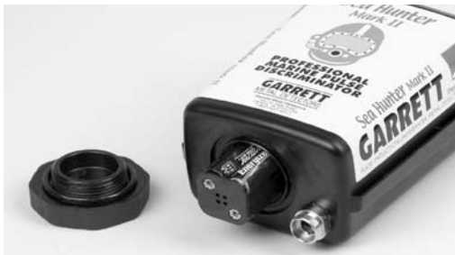
Figure 8, Proper battery pack re-installation

To access the battery pack, unscrew the battery cap at the rear of the detector housing, by hand. Do not use tools. The o-ring should remain in the control housing while the battery pack slides out. When installing batteries ensure that they are aligned with the correct polarity (plus and minus) markings. Re-install the battery pack by placing the contact end of the housing inside first and pointing downward (figure 8). Verify that the o-ring is well-lubricated and free from debris. Add a little silicon grease or petroleum