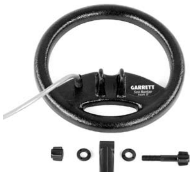
Figure 6, Parts needed to assemble stem and searchcoil

2. Attach the searchcoil to the lower stem. Align the mounting holes of the searchcoil and stem, insert the threaded bolt through the holes and hand-tighten the knobs; Do Not use tools. (Figure 6)