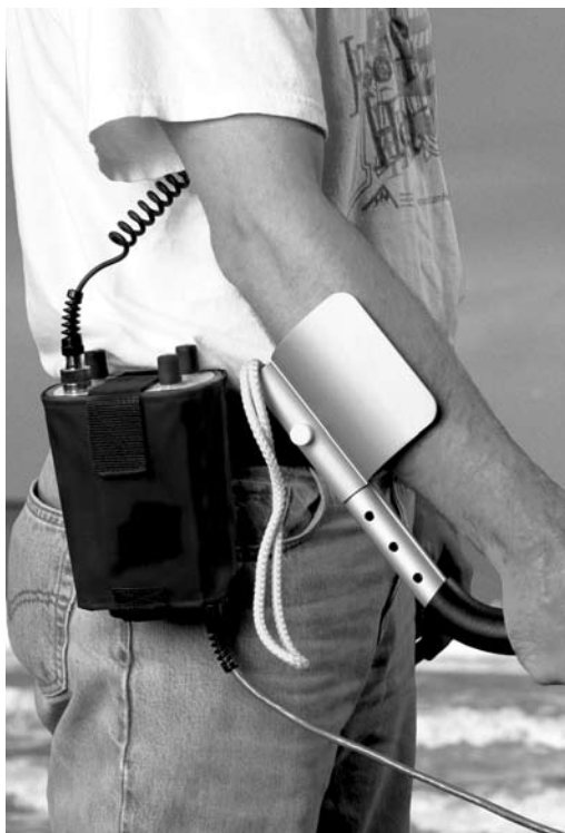
Figure 5, Long stem with hip mount configurations