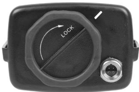
Figure 9, Proper battery cap re-installation

jelly, if necessary. Reinstall the battery cap, hand tighten it until it is flush with the housing and the two index marks are aligned as shown (Figure 9).